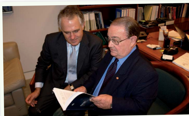
Alan with Opposition Leader Malcolm Turnbull

The 2009-10 Budget delivers a dismal trifecta: record spending (29 per cent of GDP), a record deficit (5 per cent of GDP) and a further severe increase in the jobless rate to 8.5 per cent. It has also reaffirmed Labor's stance on regional and rural communities: as long as Labor is in government, their needs will be neglected.