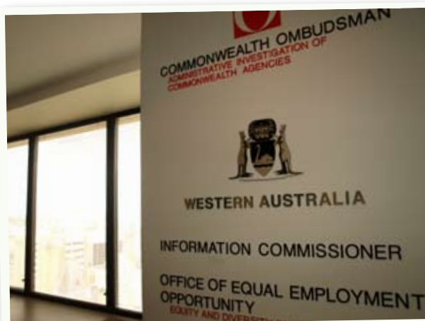
The soon to be closed Ombudsman's office on St Georges Terrace in Perth

I've written to the Prime Minister urging him to protect the interests of the people of Western Australia and allow them continued access to this vital Government service. Closing vital Government services is no way to pay back debt, particularly debt incurred through reckless spending.